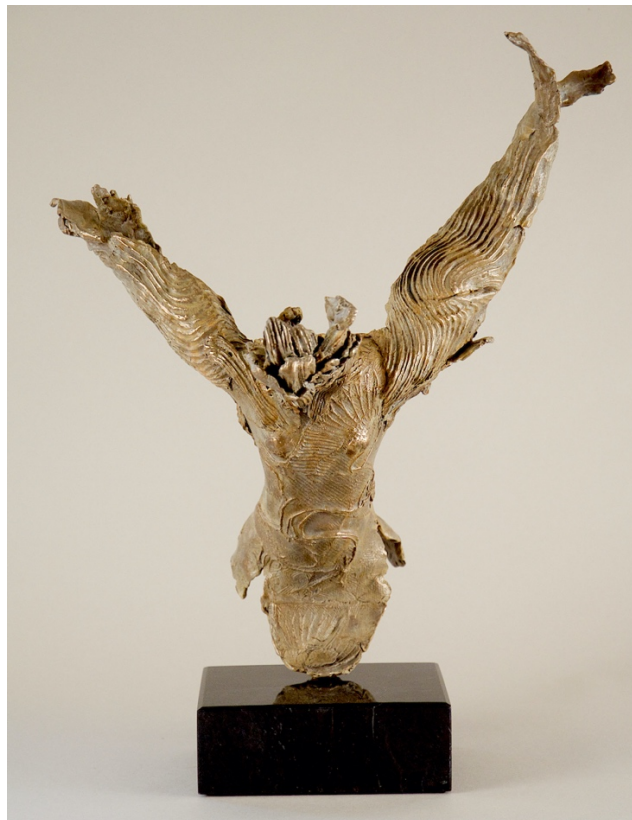
Lisa Kenion Euclid, Ohio Owl Woman Cast bronze, 17 x 12 x 7 inches, 2018