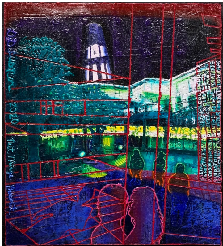
Dennis Deusner Evansville, Indiana Past Things Present Mixed medium on wood, 57 x 51 x 2 inches, 2020