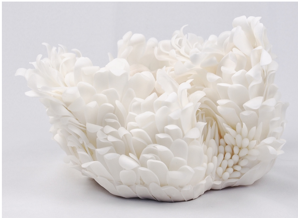
Weiting Wei Powell, Ohio Your Armor Polymer clay, air-dry clay, 8 x 11 x 10 inches, 2020