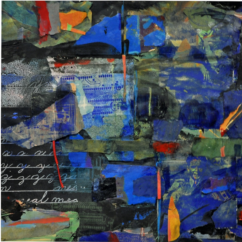
Bill Whorrall Shoals, Indiana Good Posture Mixed media, 12 x 12 inches, 2020