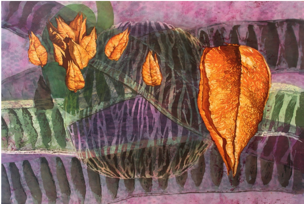
David Lucht Paducah, Kentucky A Pod Thing Happened Batik, 20 x 32 x 1 inches, 2018