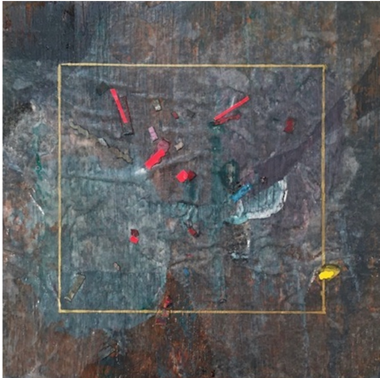
Amy Delap Vincennes, Indiana Jetsam Mixed-media, 8 x 8 x 1 inches, 2020