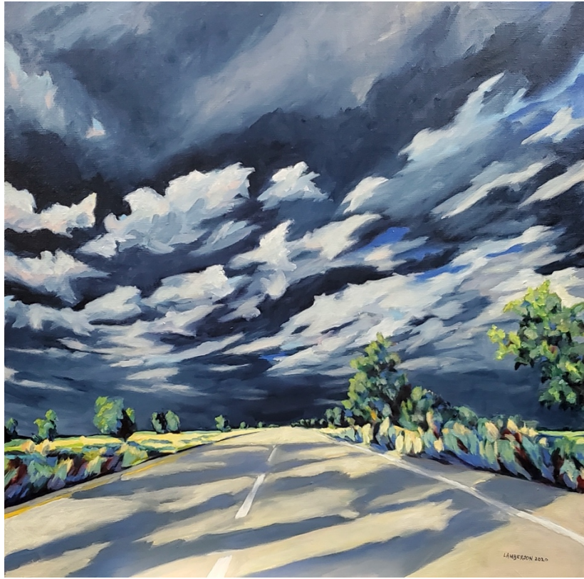
Sheila Lamberson Bloomington, Illinois Northbound Oil, 24 x 24 x 1.5 inches, 2020