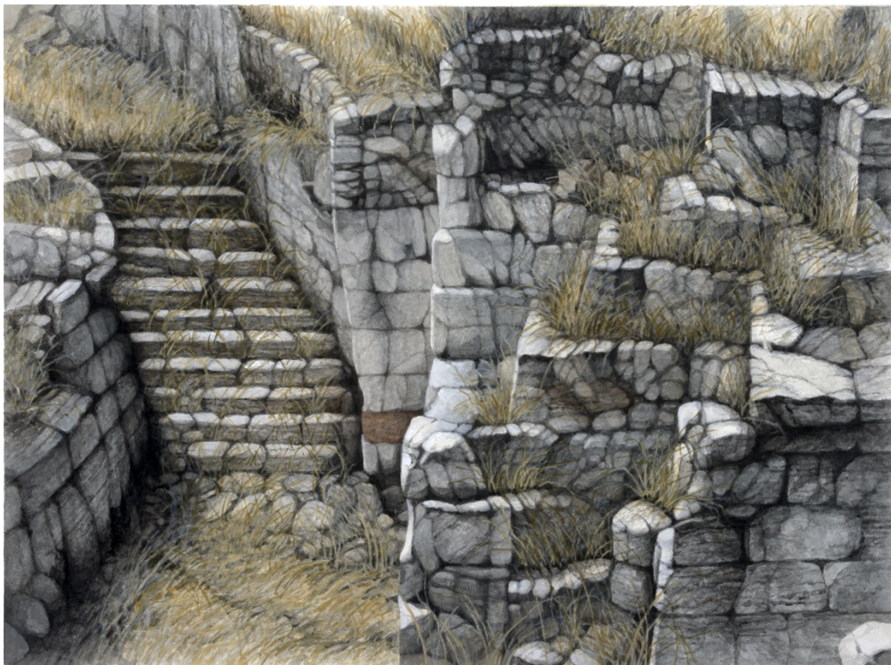
Terry Lay St. Louis, Missouri The Last Remaining Seats Watercolor on paper, 17 x 23 x 1 inches, 2020