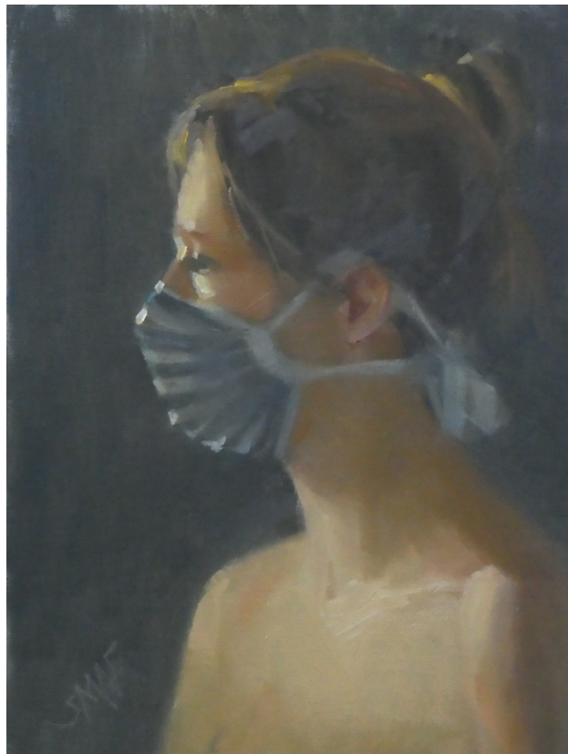
Shirley Fachilla Brentwood, Tennessee

Mixed media vessel created from woven photographs, 7.5 x 8 x 3 inches, 2018