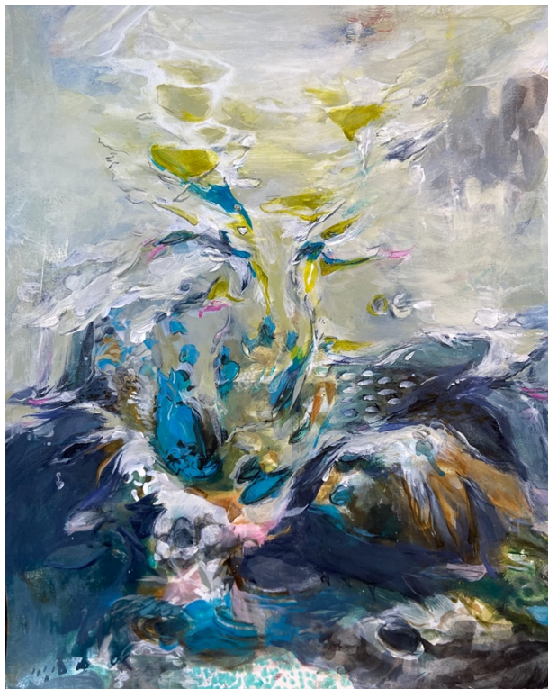
Jaime Foster Naperville, Illinois In Between Days Acrylic, ink and watercolor on Paper, 20 x 16 x 2 inches, 2020