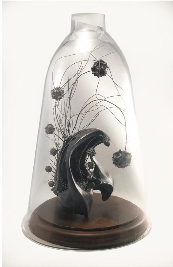
Carrie Longley Brookville, Ohio Asclepias syriaca Porcelain, wire, glass, and wood, 11 x 7 x 7 inches, 2020