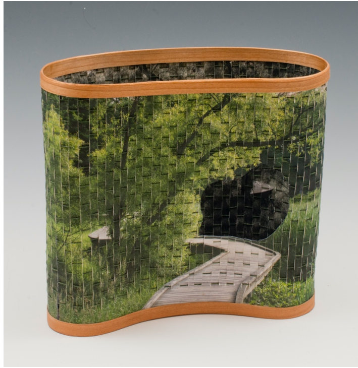
Emerald Estock Franklin, Tennessee Nature's Beckoning

Mixed media vessel created from woven photographs, 7.5 x 8 x 3 inches, 2018