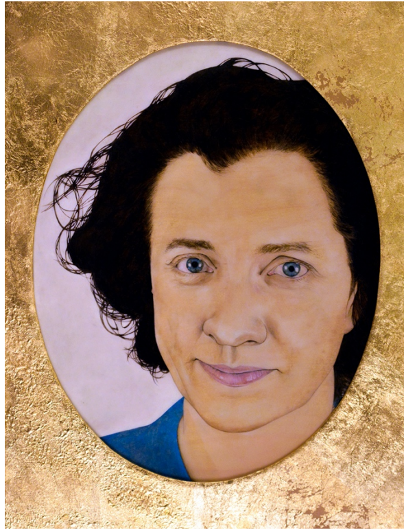
Todd Fife Bowling Green, Kentucky Maggie Oil, gold leaf and resin, 24 x 18 x 1 inches, 2019