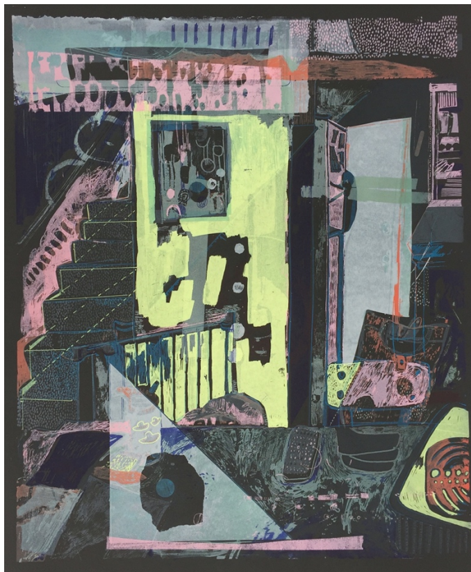
Christine Abbott Columbus, Ohio Preparing for the Next Day Silkscreen, edition of 7, 26 x 22 inches, 2019